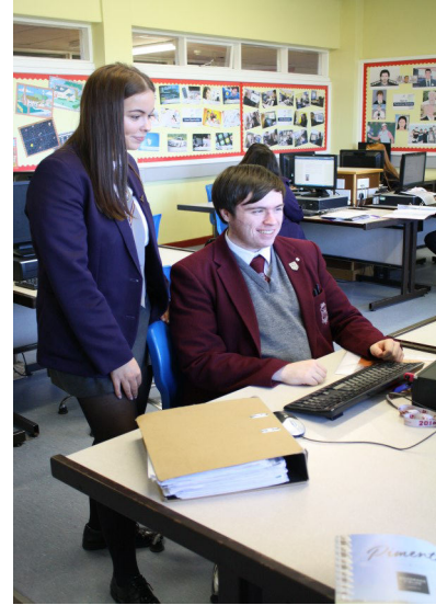
Media Studies students get down to business