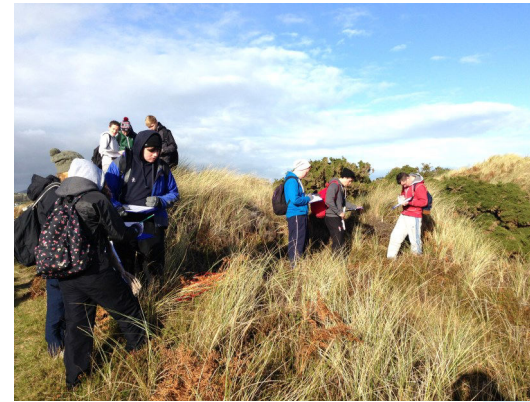
CLC students on field trip to Murlough Bay