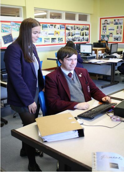
Media Studies students get down to business