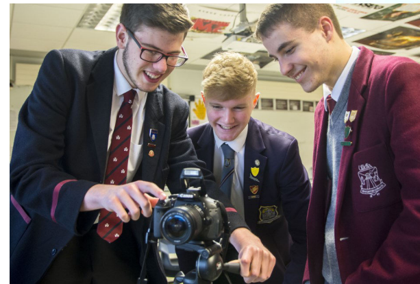
It's pointing the wrong way for a selfie!