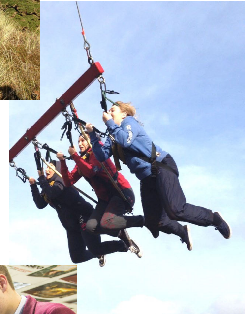
Tourism students mixing work with play