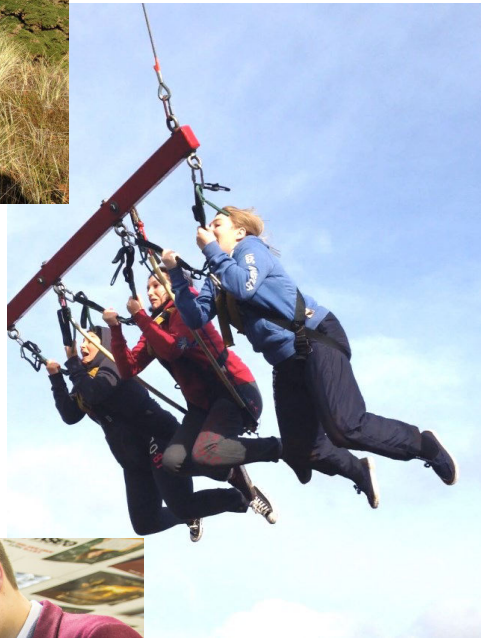
Tourism students mixing work with play