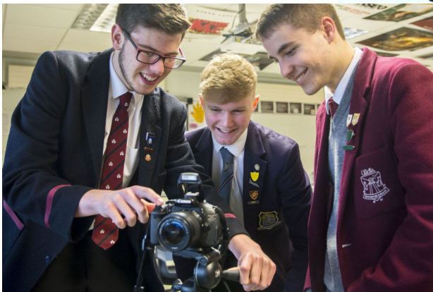
It's pointing the wrong way for a selfie!