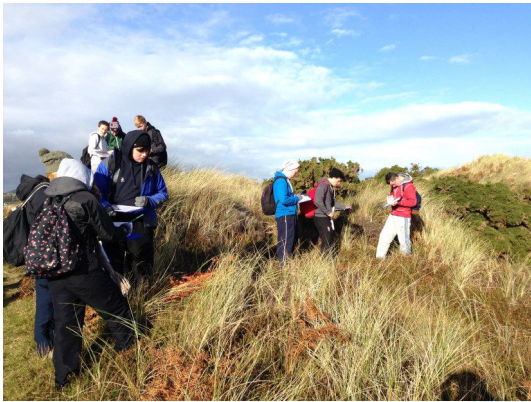
CLC students on field trip to Murlough Bay